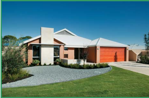
The Elements Sustainable Home, Atwell

The Australian Network for Universal Housing Design is a national collective of organizations, agencies and housing providers who support the call for universal design in housing.